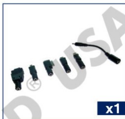
Phone Charger Adapters