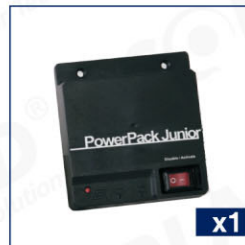
Solar Power Pack Junior