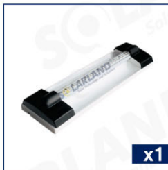
LED TL Lamp