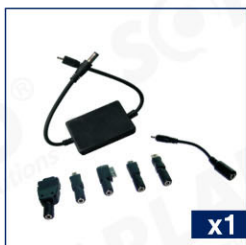
Phone Charger Adapters